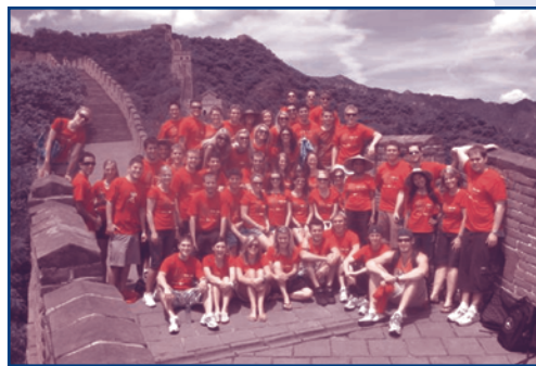
Eller Global Cohort, 2009.

On May 18th, 2009, 50 Eller undergraduate students arrived in Shanghai International Airport. Despite jetlag and a long trip from Tucson, the Eller Global Cohort was excited for their upcoming seven weeks of study